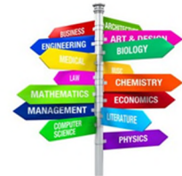
Topics and Disciplines Listed

If your organization publishes grey literature, enter it here https://www.surveymonkey.com/r/X8TKLX2