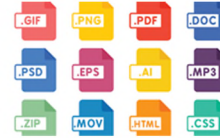
File Formats Listed